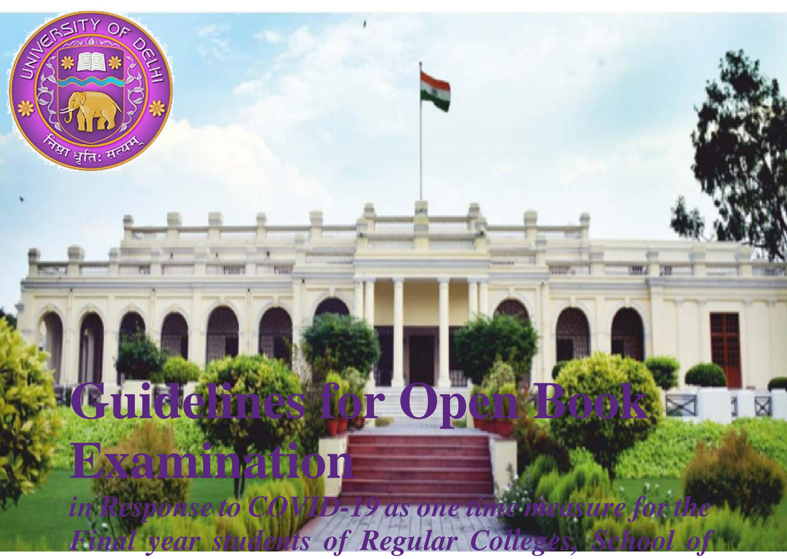
Open Learning, Non-Collegiate Women Education Board and Ex-Students